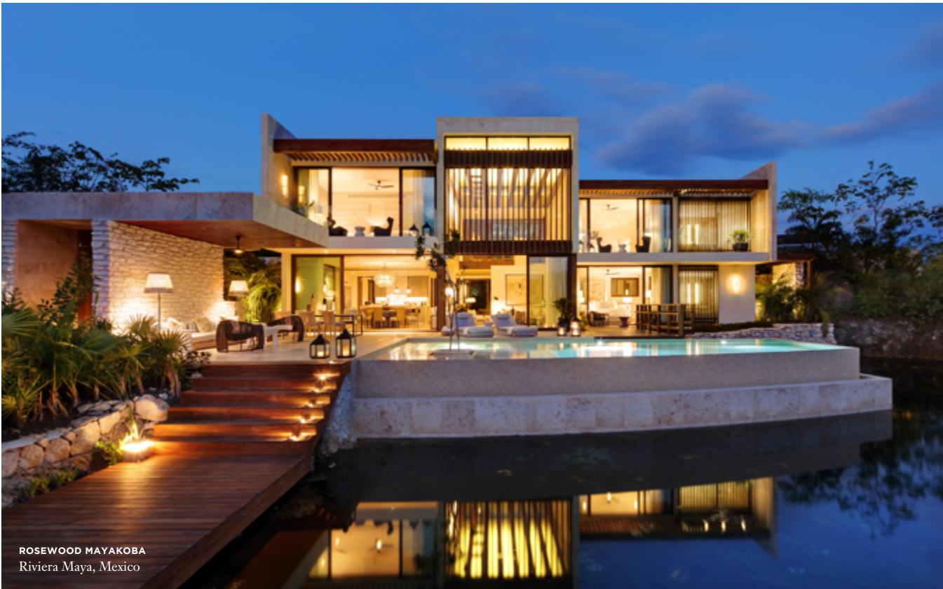
ROSEWOOD MAYAKOBA Riviera Maya, Mexico