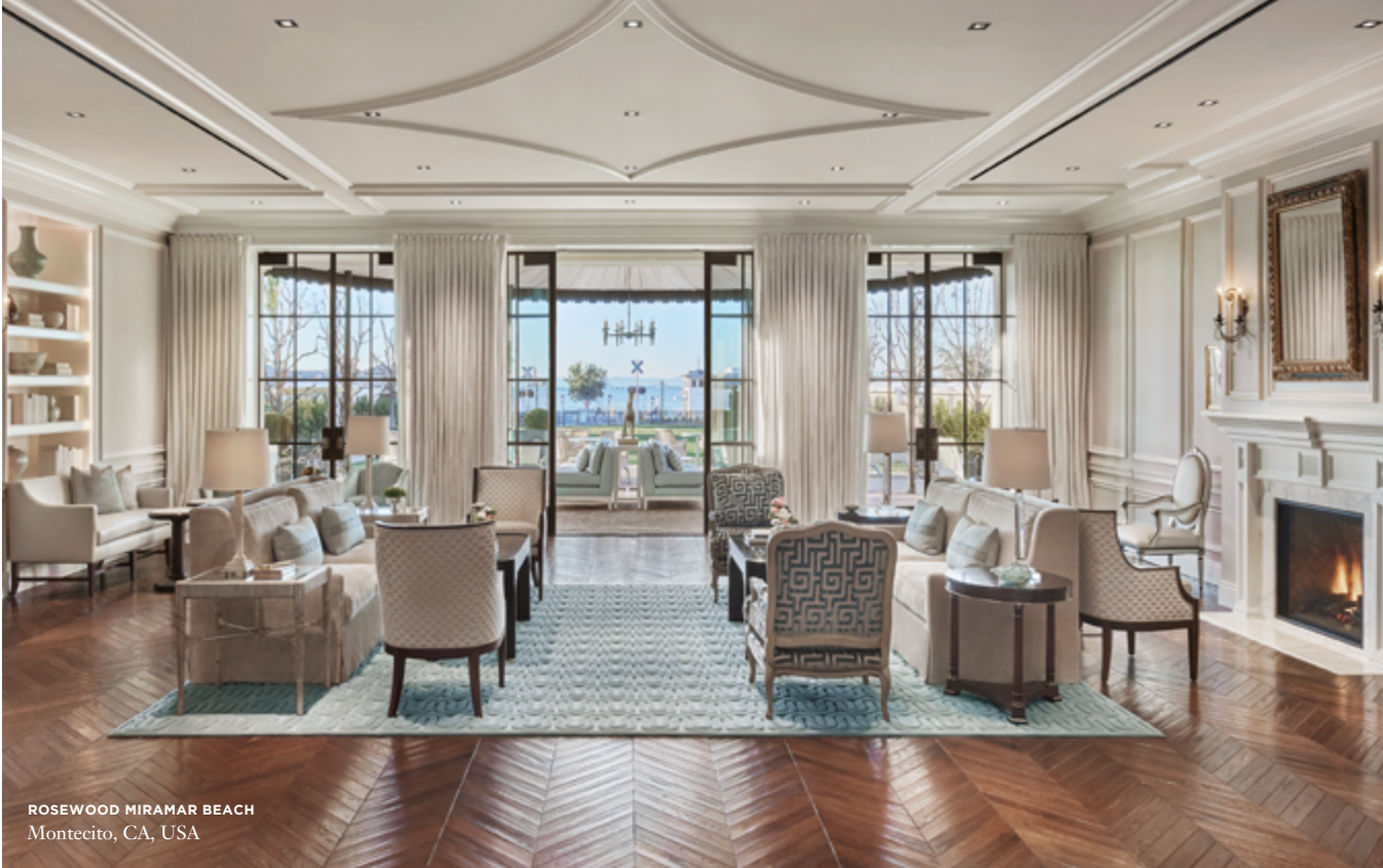
ROSEWOOD MIRAMAR BEACH Montecito, CA, USA